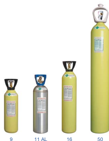
9 11 AL 16 50